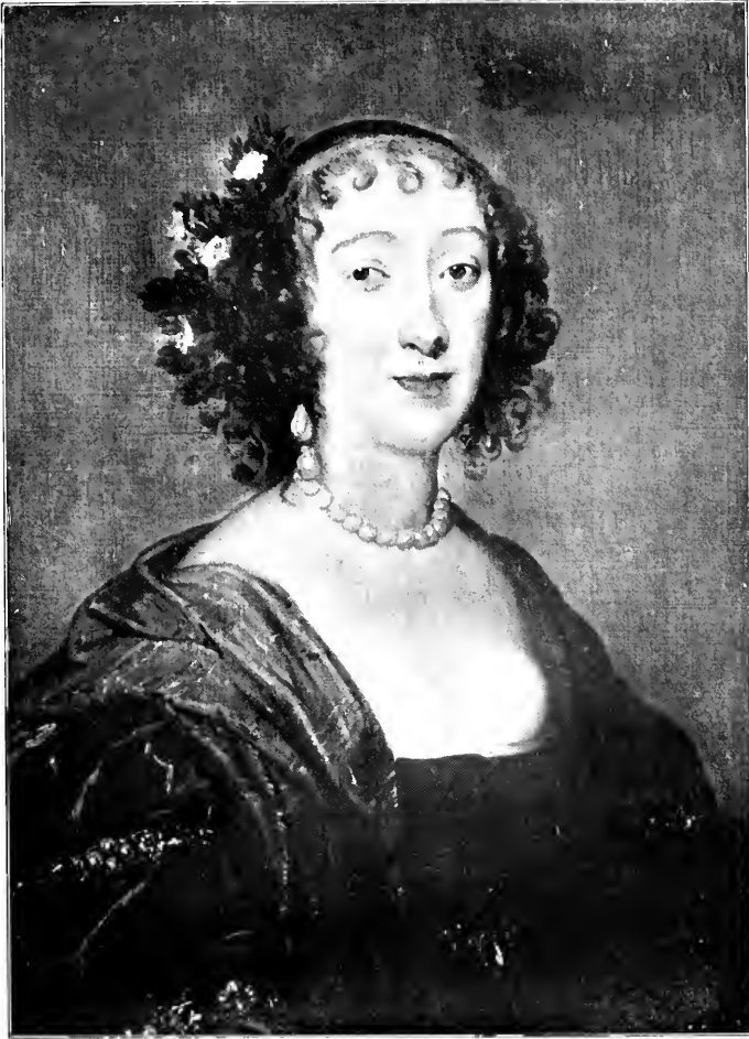
DOROTHY, COUNTESS OF LEICESTER.